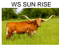
WS SUN RISE