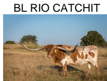
BL RIO CATCHIT