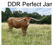
DDR Perfect Jam