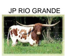
JP RIO GRANDE