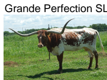
Grande Perfection SL